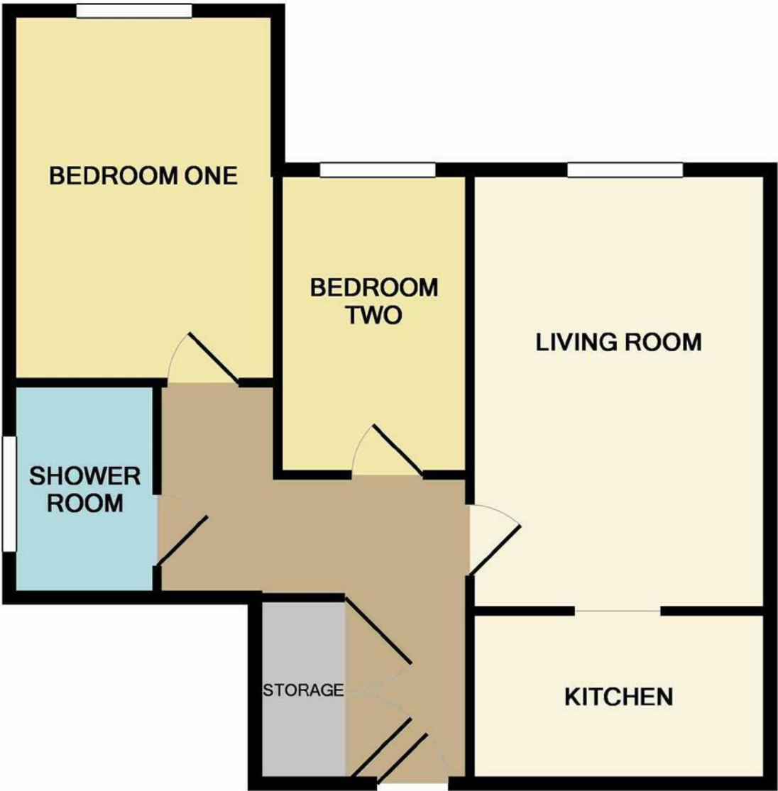
PLAN NOT TO SCALE FOR INFORMATION ONLY Made with Metropix ©2016