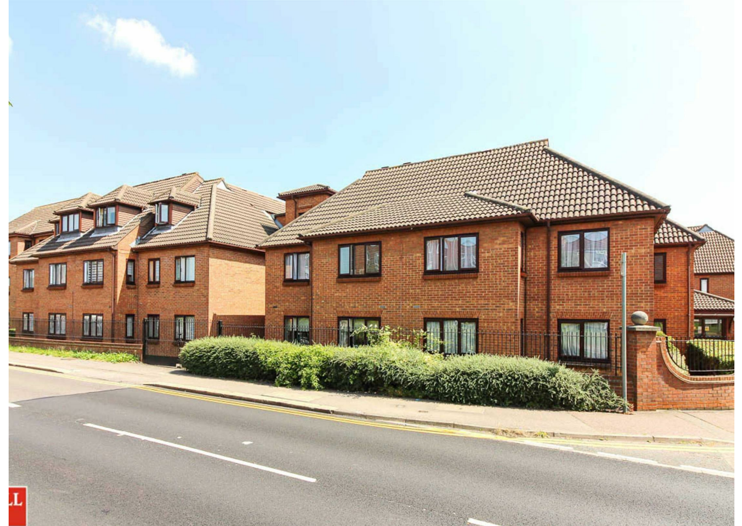
Regency Lodge, IG9 6EF Asking Price £290,000 Leasehold